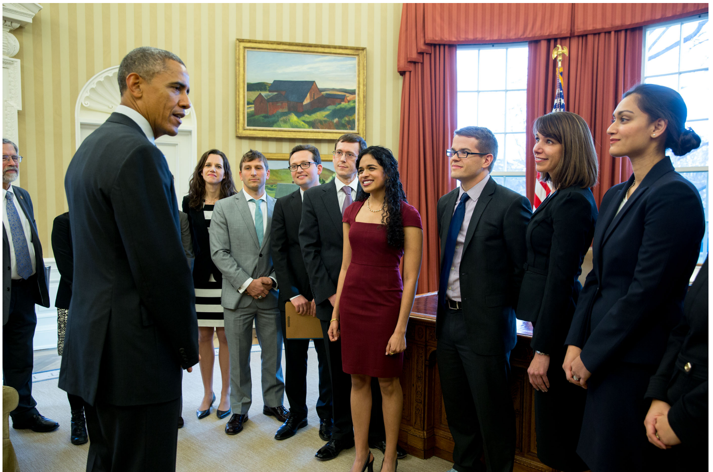
President Barack Obama speaks with members of the Social and Behavioral Sciences Team in the Oval Office in January 2015.

Summary: The President signs an Executive Order to establish the first-ever Social and Behavioral Science Team (SBST) to design human-centered federal programs.